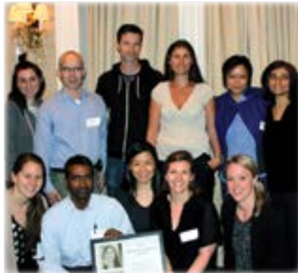
The SALOME team in 2016.